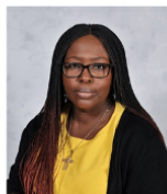
Federation Designated safeguarding lead (DSL):