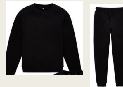
Outdoor PE Kit: Jumper Jogging Bottoms