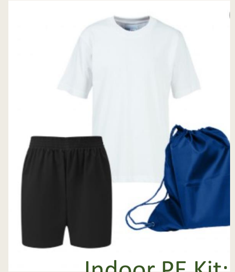
Indoor PE Kit: T-shirt Shorts

They will need to get undressed and dressed independently for PE so please allow them time to practise at home.