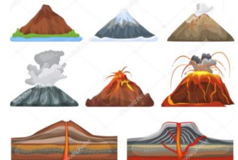
Types of Volcano

As readers , we will explore and discuss the struggles of Varjak Paw as he overcomes his fears, learns the teachings of the Way and defeats the monsters Outside the city, in the self-titled book. Will he have the courage and mental strength to save his family?