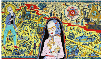
Textiles: Greyson Perry