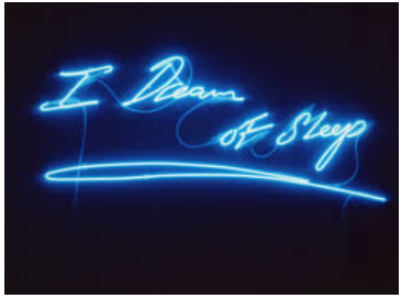
Words & language