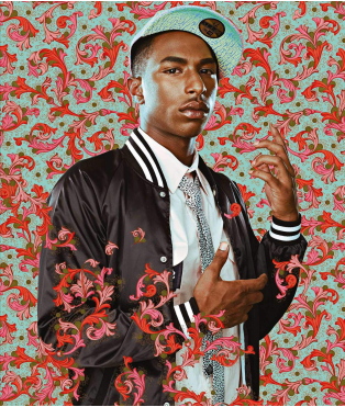
Fine Art/ Photoshop/ Photography