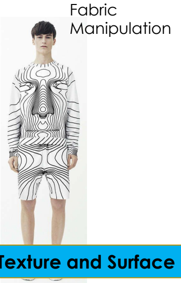
Texture and Surface

Exploring Fine Art: observational sketching, shade and tone, water colour, texture and tone, lino printing, portraiture, collage