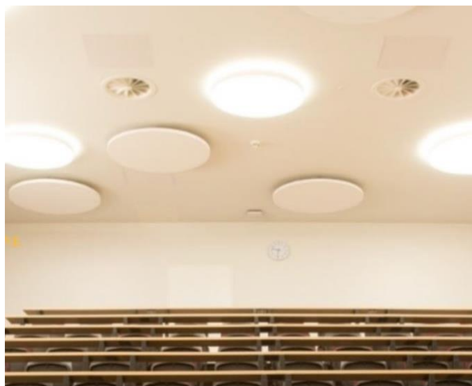
Our state of the art, purpose built lecture theatre