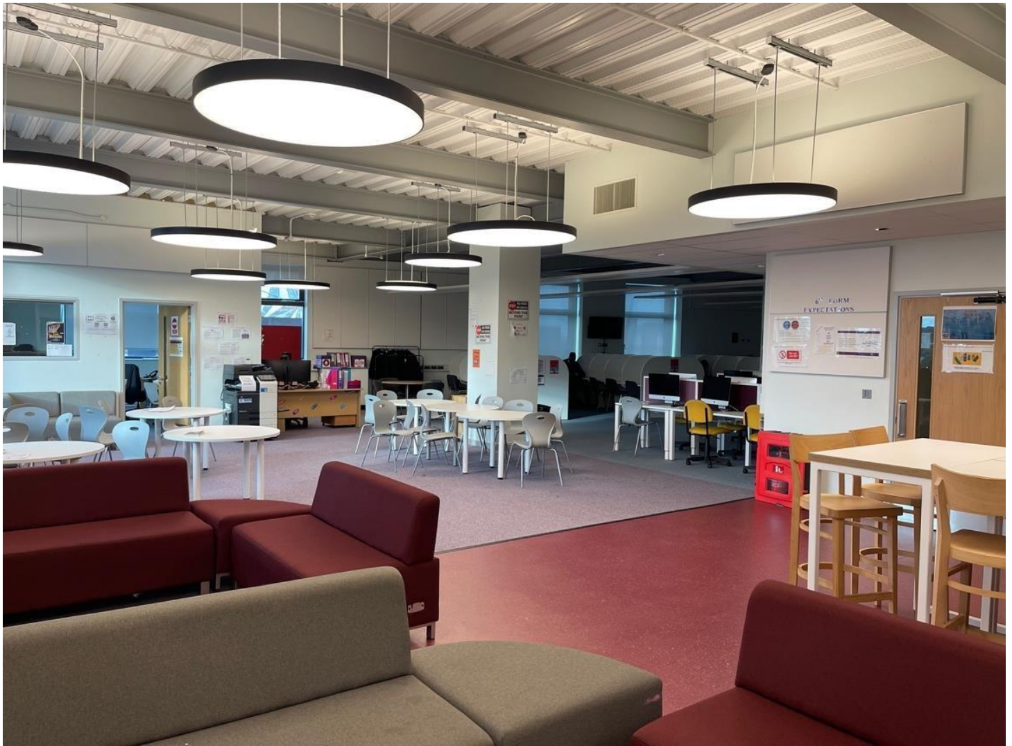
Our sixth form hub where students have the opportunity to do study in groups or independently using Macbooks.

TO GROW IN FAITH, LIVE AS FAMILY AND BE UNITED IN FELLOWSHIP