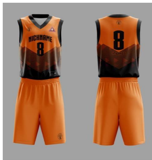
Our BTEC students have custom designed sports kit

Physiotherapist, Sports Psychologist, PE Teacher, Sports Scientist, Strength Coach.