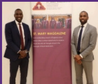
(Co-Heads of School)