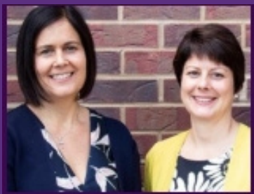
(Federation Executive Co- Headteachers)